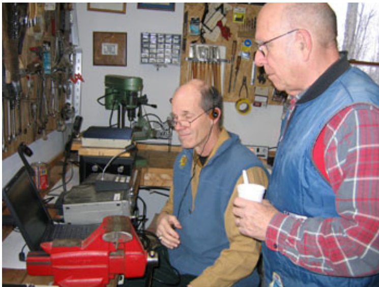
The coordinated wardrobe is always a nice touch. Thanks KB1MOV and WB1BRE!

What bands do we operate? This year we will be operating 6M, 2M, 222, and 432 Mhz for contacting mobile operators and fixed stations. You can operate SSB, FM, CW and digital during the contest. There are four separate operating positions in my shack/workshop in the garage in a 225 sqft room with heat, lights and comfortable seating. We may add