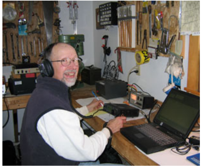
This guy looks familiar, doesn't he?

This is a fun contest with relaxed operation and even time for short QSOs. Depending on band openings, you can get some surprising distance on VHF and UHF. Please plan to join us for this mid-winter club event and experience comfortable operating in spite of wind and snow!