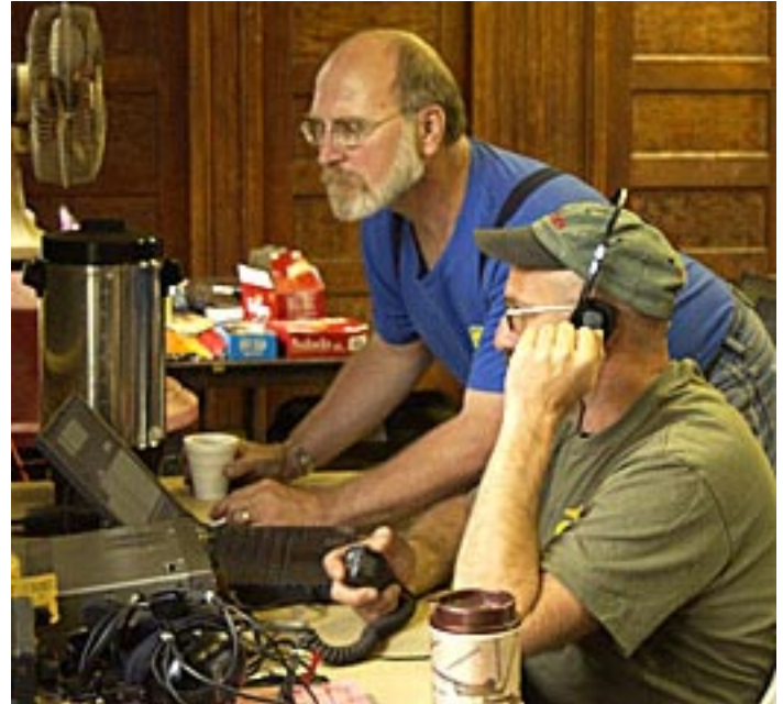
At the GOTA Station

Opinions expressed in The Monitor are those of the individual authors and do not reflect the opinions or policies of The Twin State Radio Club, Inc.